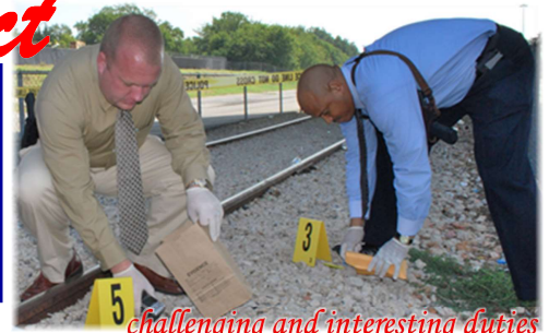
challenging and interesting duties