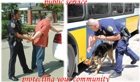
protecting your community

advancement opportunities due to growth related to planned rail expansion